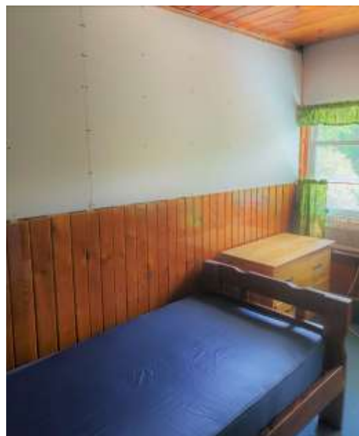
Partially Remodeled Small Room