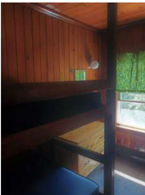
Current Small Room

Please contact gene@campmack.org if you have any additional questions.