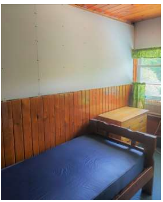
Partially Remodeled Small Room