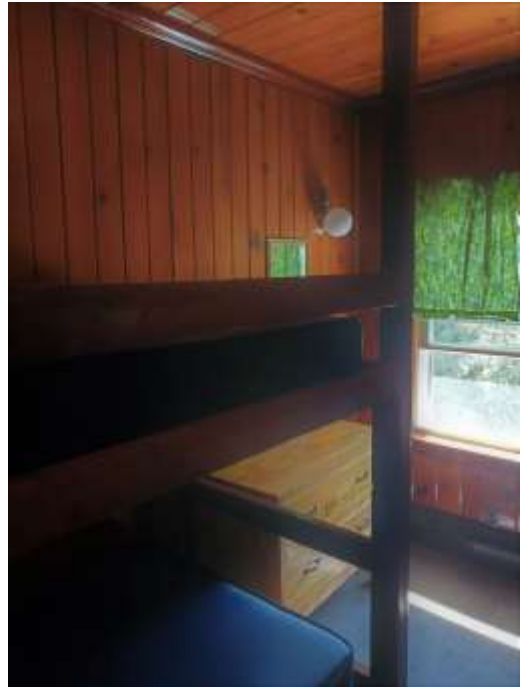
Current Small Room

Please contact gene@campmack.org if you have any additional questions.