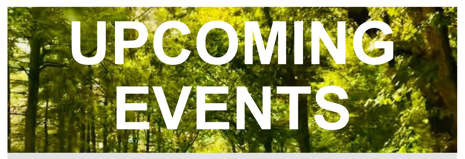
August Family Camp and Retreat

• <u>Colony Camp</u> August 19–21 Fun and fellowship for the whole family! Colony Camp is a great opportunity to experience some summer fun with your family before everyone heads back to school. Enjoy the planned group activities along with boating and swimming, or