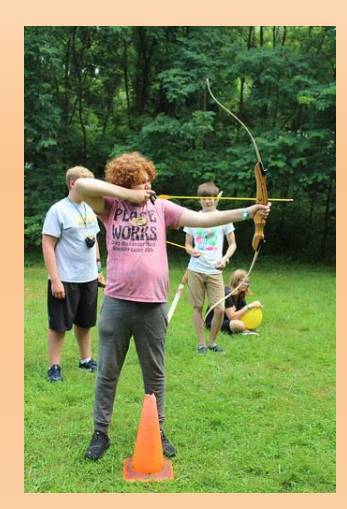
Learning new skills