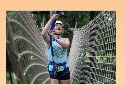
Facing new challenges