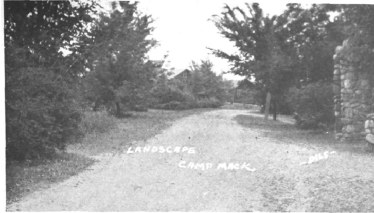
Looking S. E. (Without Shade to This)

Sec. 7. Camp Manager. It shall be the duty of the Camp Manager to direct the physical arrangements necessary for camp life; have charge of the work crew—kitchen, dining hall and grounds; to buy the materials needed and have general charge of the Camp Property, reporting annually to the Directors. A care-taker may be hired for the summer season, to have charge of the grounds, and carry out such actions as delegated to him by the Board of Directors. The camp manager shall be an ex-officio member of all other camp committees.