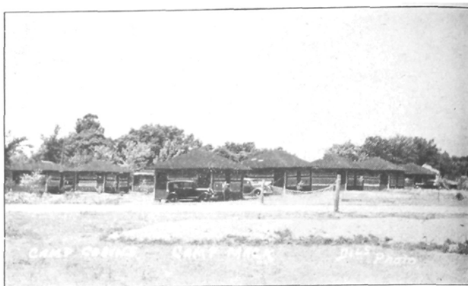
First Twelve Cabins (1925)