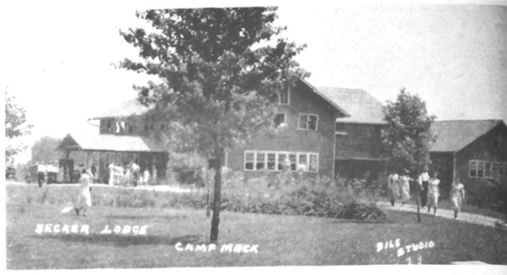
Becker Lodge (Camp Headquarters) (1931-1934)