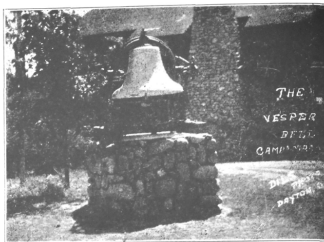
The Vesper Bell Calls to Worship