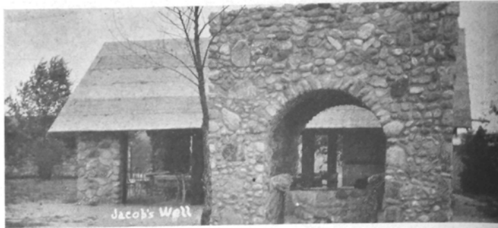
Jacob's Well and Lunch Room

meeting and Camp, when such amendments are passed by a majority vote of both the entire Board of Directors and the Young People's group in Camp.