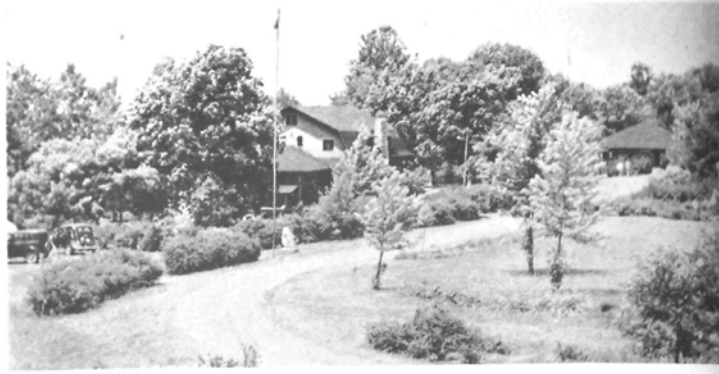
Looking N. W. (From Cornfield to This)

2. The First Vice-President shall preside at meetings of the Board or Executive Committee in absence of the president, and perform such other duties as the President or Board may indicate.