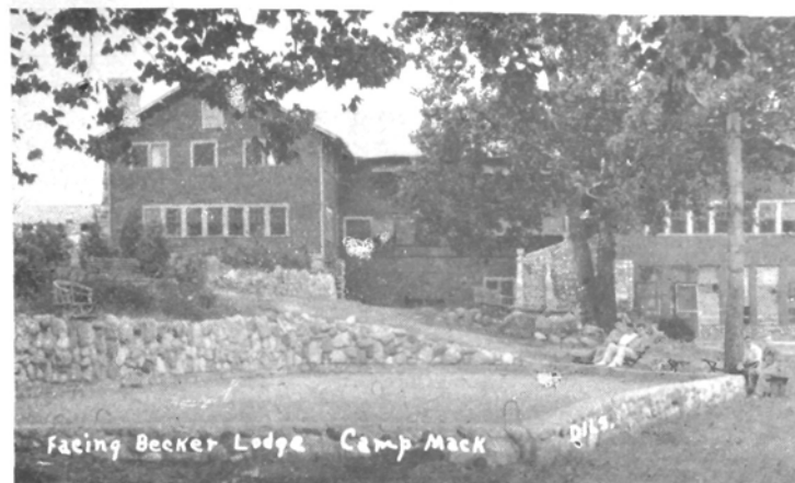
Rock Garden (Near Lodge and Beach)