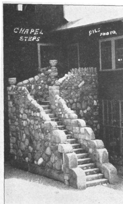
Becker Chapel Steps

Sec. 2. There shall be associate directors chosen as needed and advisable. The President of the Youth Cabinet of each state district (N. E. Ohio, N. W. Ohio, Southern Ohio, Southern Indiana, Middle Indiana, Northern Indiana and Michigan, Southern Illinois, Northern Illinois and Wisconsin) shall serve as an associate director for his state district.