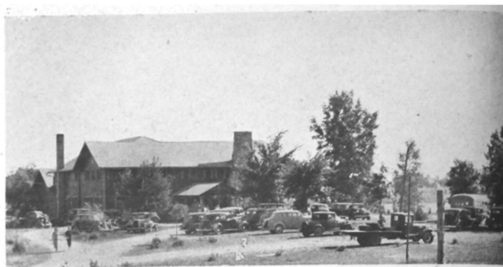
Enrollment Day at Camp