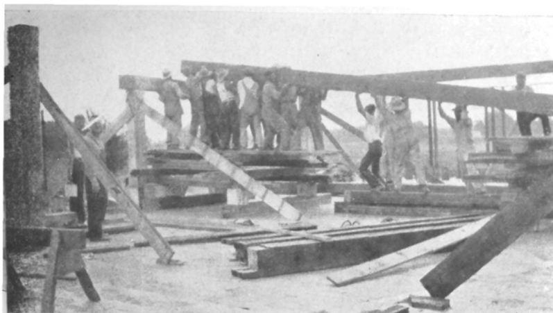
Wawaka Helps Build Becker Lodge (1934)