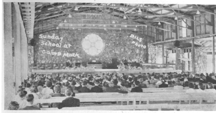
Sunday Service at Camp

Peninsula area secured by purchase. Second tennis court. New Paris helped landscape the new ground. Aid Societies gave generously.