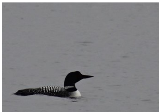
Common Loon on Lake Waubesa