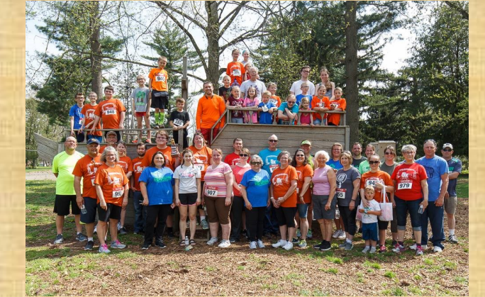
<u>Costs</u> 5K: $20 Kid's Fun Run: $10

$75 family rate for families of 4 or more (Paper Registration only)